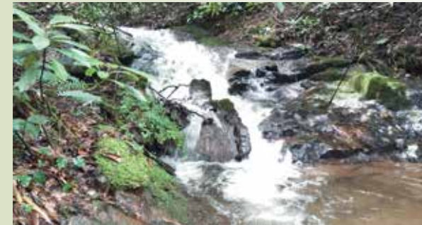
A waterfall at Padgett/Bilbee Memorial Preserve.

And while we're at it, we've mapped the invasive species threats on the Plateau and are undertaking control efforts where possible, including the eradication of garlic mustard at the known infestation points.