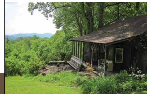
The Zaher homestead.

TNC Conservation Easements: The Nature Conservancy has transferred four easements to HCLT for management and monitoring. These include two pieces of the Ravenel remnants in the Highlands area that conserve old growth forests; the Sanson Wildlife Preserve outside Cashiers that protects old growth forest and borders other HCLT-conserved lands; and the cliffs and summit of Big Sheepcliff Mountain in Cashiers, which also borders other HCLT-conserved lands.