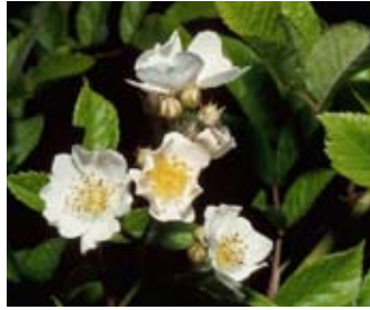
The invasive multiflora rose

The National Invasive Species Information Center classifies invasive species as non-native species whose introduction causes, or is likely to cause, economic or environmental harm or harm to human health. The Center for Invasive Species and Ecosystem Health at the University of Georgia lists 1,482 plants as invasive in the U.S.